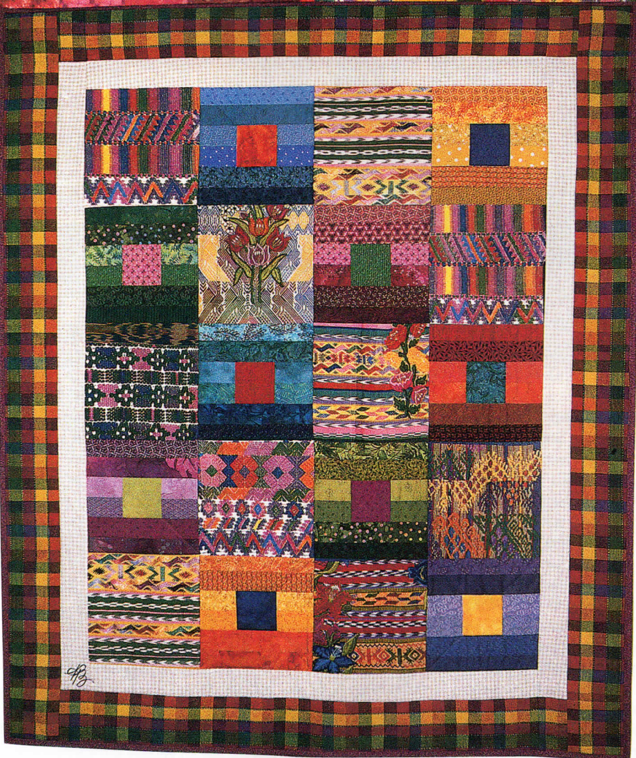
WE COMPLEMENT EACH OTHER, 44" x 53", 2000. Designed, constructed, and quilted by the author. ABOVE LEFT: Detail.

woven textiles into my art quilts evolved as a very natural, comfortable thing to do. Being Guatemalan and proud of my heritage, I wanted to imprint my cultural identity into my