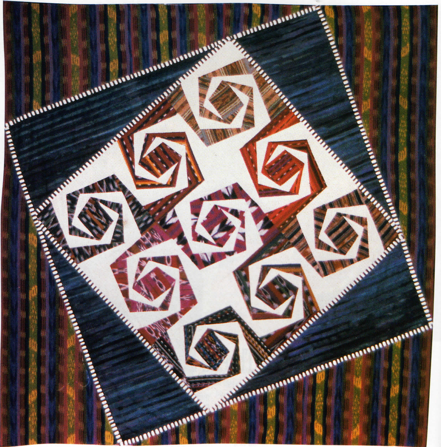
WHIRLPOOLS GOING ROUND 'N' ROUND, 56" x 56", 1999. Designed, constructed, and quilted by the author.